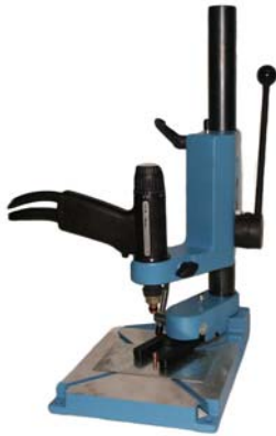
Bench Mounting Unit