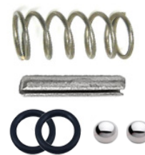
Tune Up Kit