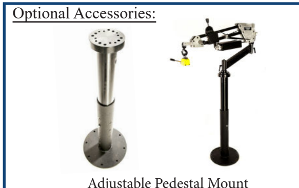
Adjustable Pedestal Mount

Visit our website at www.StudWeldProd.com or email Info@StudWeldProd.com