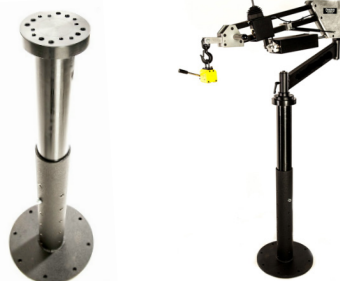
Adjustable Pedestal Mount

Visit our website at www.StudWeldProd.com or email Info@StudWeldProd.com